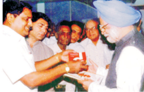
Dr. Manmohan Singh Hon'ble Ex. Prime Minister of India