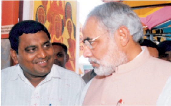
Narendra Modi Hon'ble Prime Minister of India