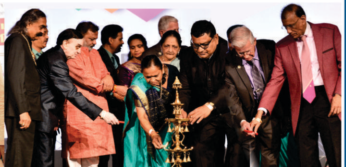
Friends of Gujarat - USA 2016