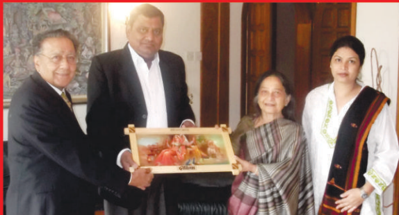
With Mr. Manu Chandaria Kenya