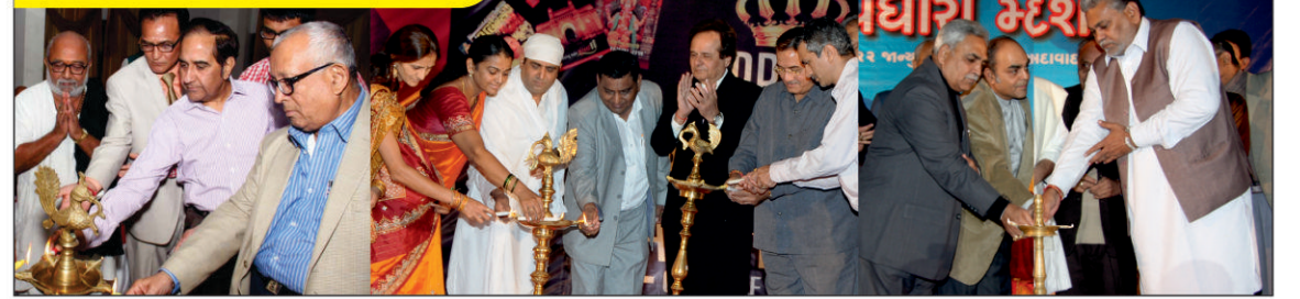
NRI Meet... 2014-15- Vadodra