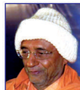
Pu. Hariprasad Swamiji