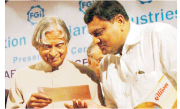
Late Dr. Abdul Kalam Hon'ble Ex. President of India